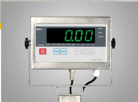
STAINLESS STEEL BX-1 INDICATOR