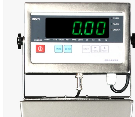
Full-featured weighing indicator