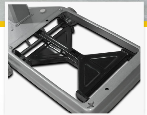
Double V-shape lever