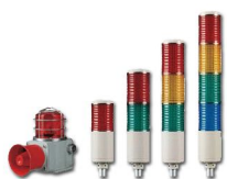
LIMIT ALARM & LIGHT