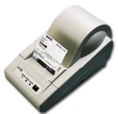
BARCODE LABEL PRINTER