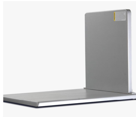
100% machine-manufactured precision